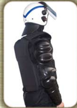
BALISTIC HELMETS PASGT